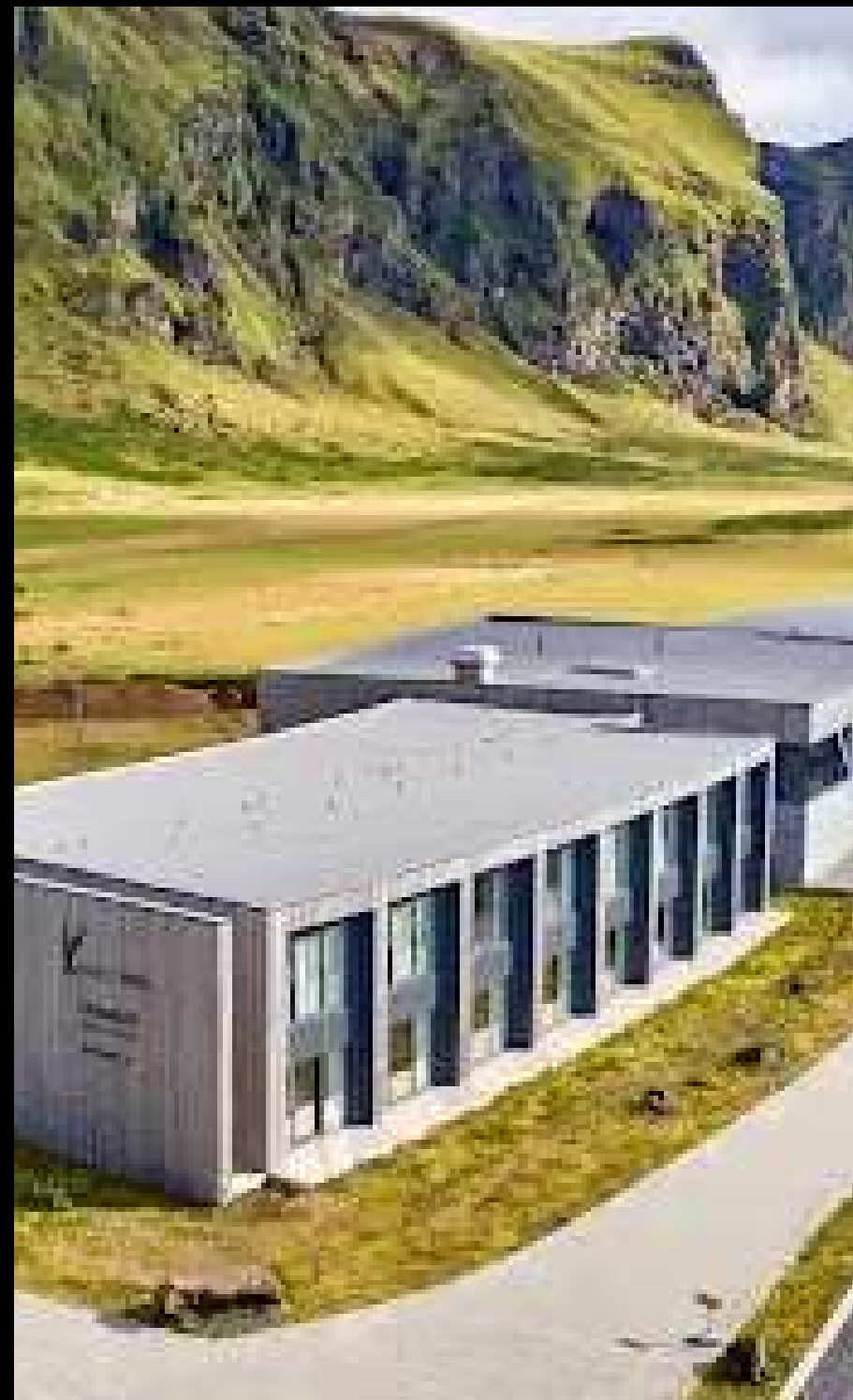
Hotel Vík í Mýrdal or a comparable boutique retreat.