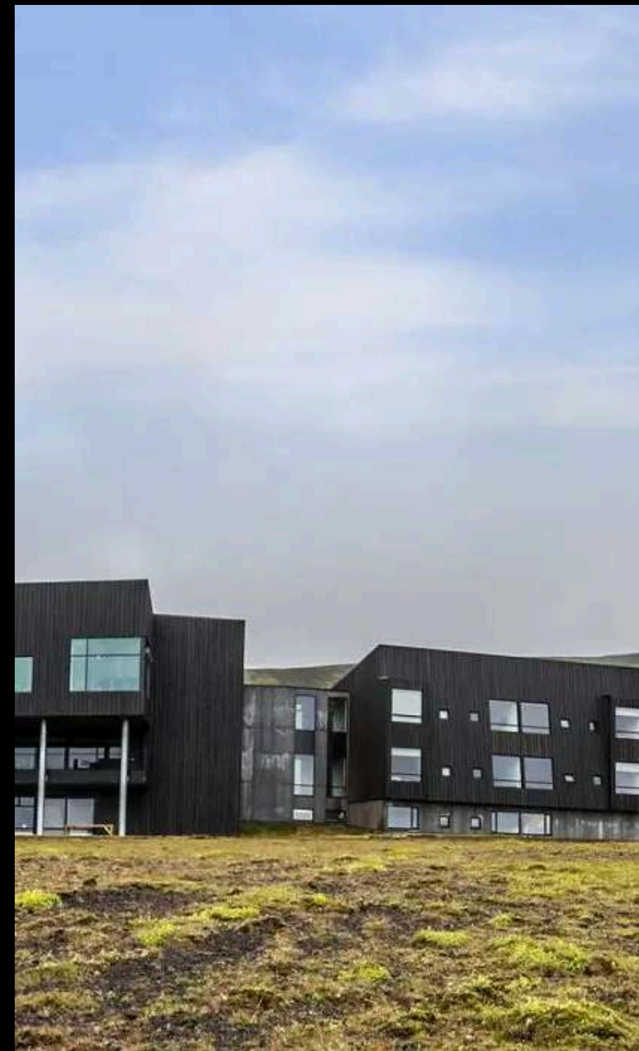
Fosshotel Glacier Lagoon, a luxury property nestled between natural wonders.