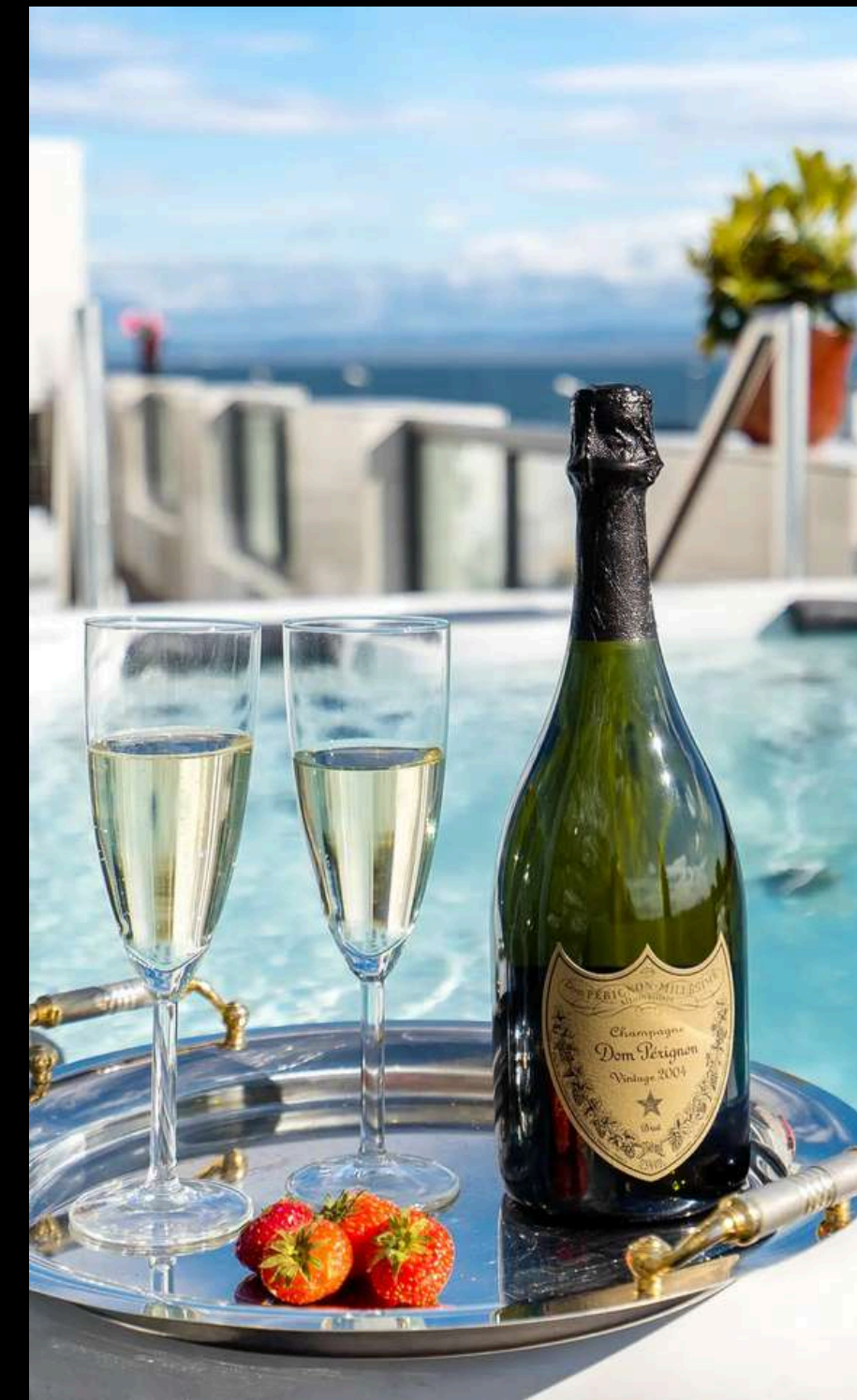
Hotel Keflavik or an equally premium alternative for your departure convenience.