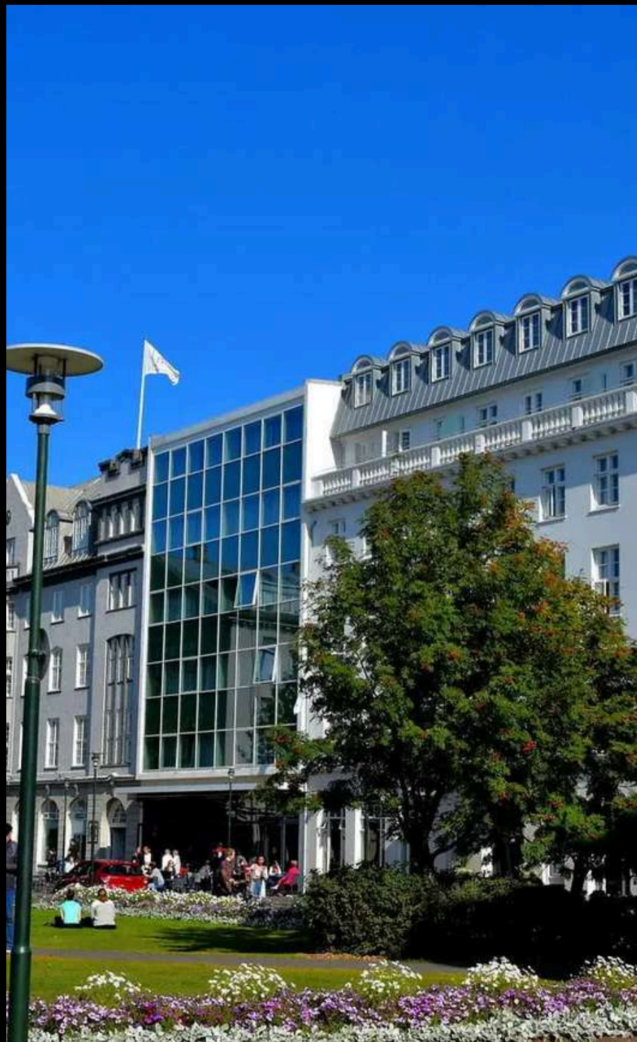
Hotel Borg, Reykjavík or a similar downtown property in Reykjavik.