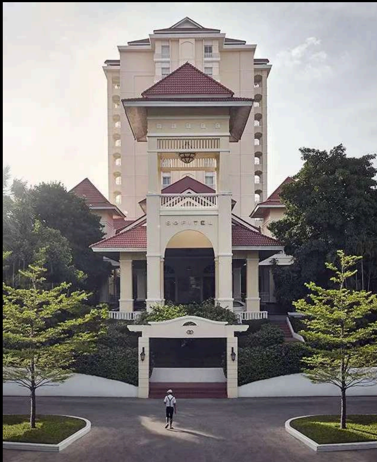
Sofitel Phnom Penh Phokeethra in Superior Rooms, offering a blend of French elegance and Khmer heritage.