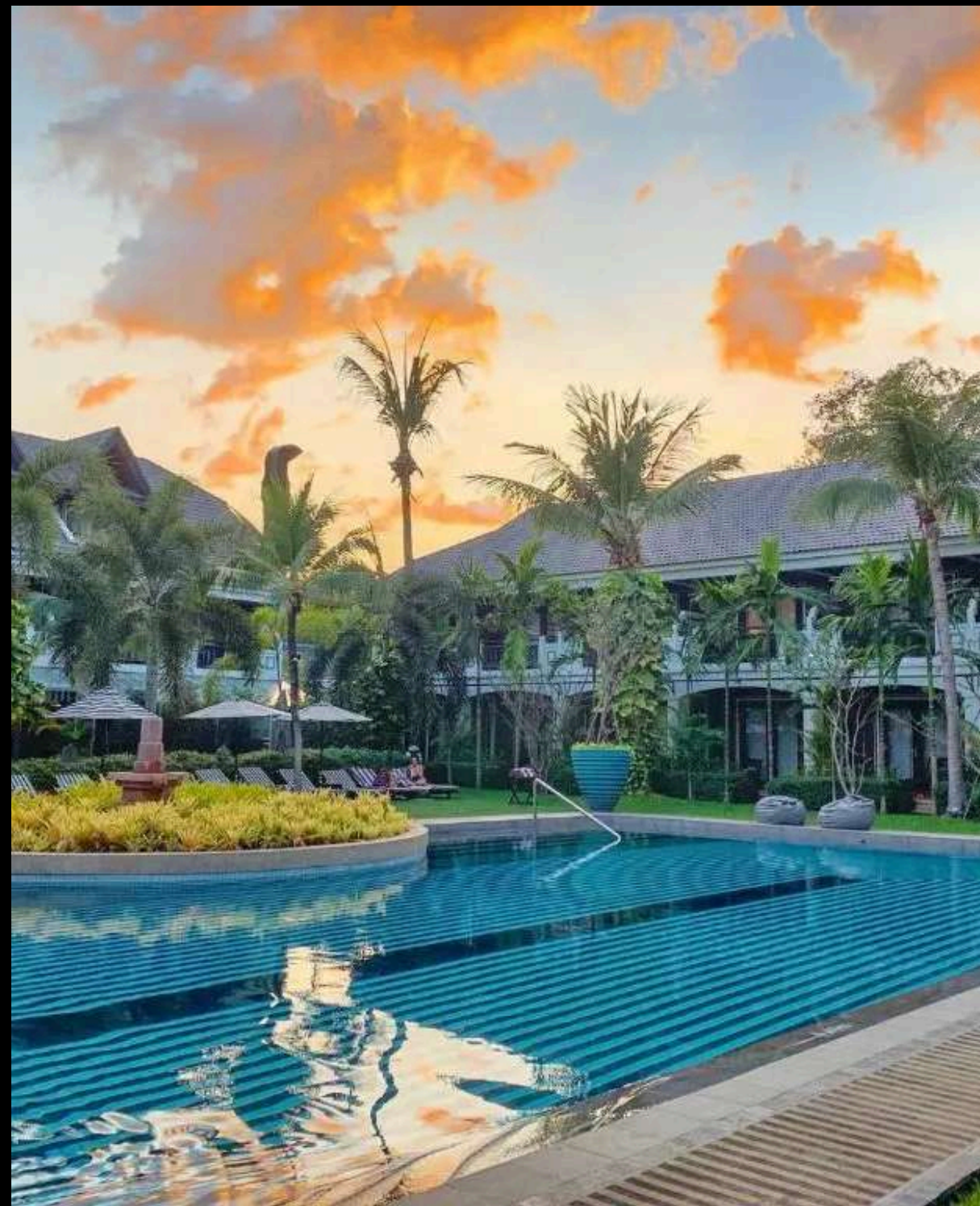
Shinta Mani Angkor in Boyan Rooms, a boutique retreat inspired by Angkorian design.