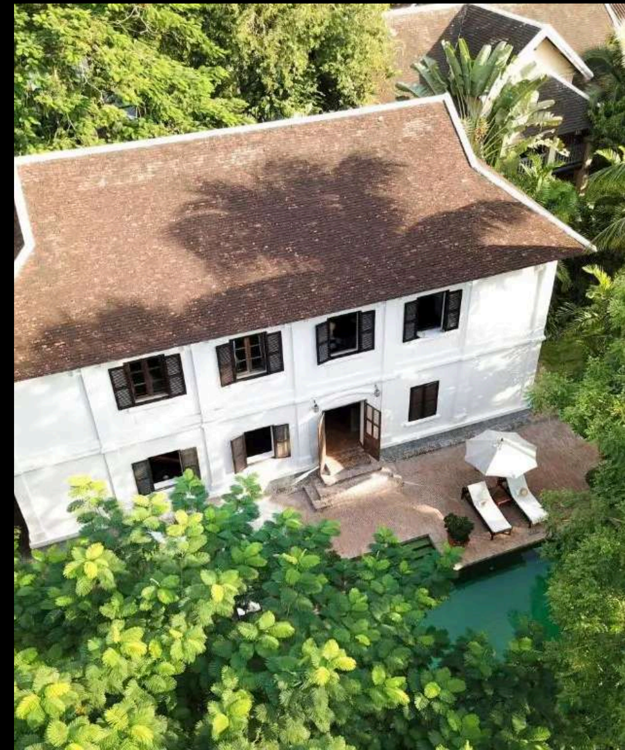
Satri House Boutique Hotel in Deluxe Rooms, an oasis of tranquility in Luang Prabang.