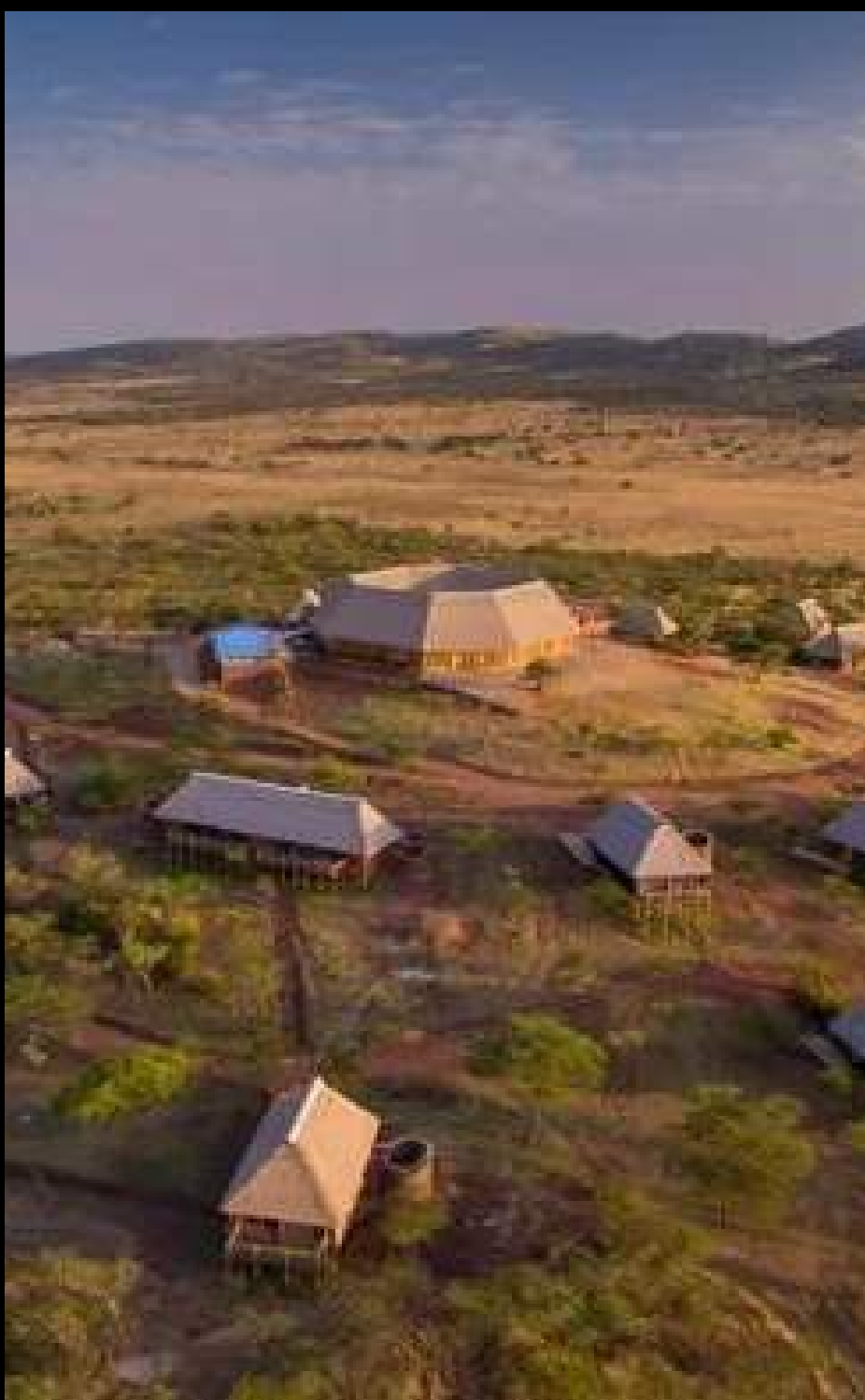
Lahia Tented Lodge