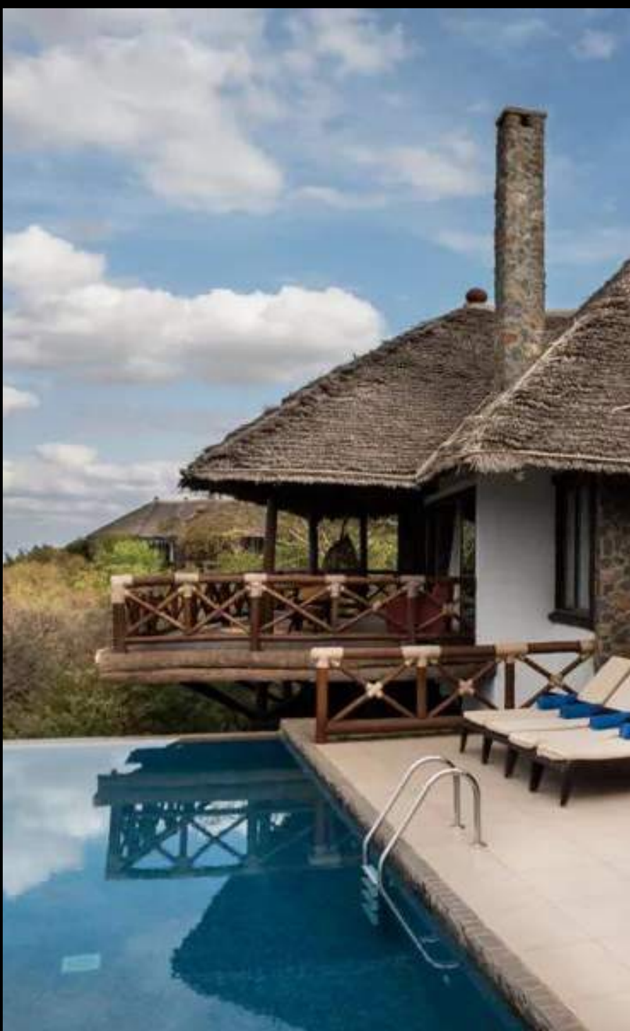
Lake Manyara Kilimamoja Lodge