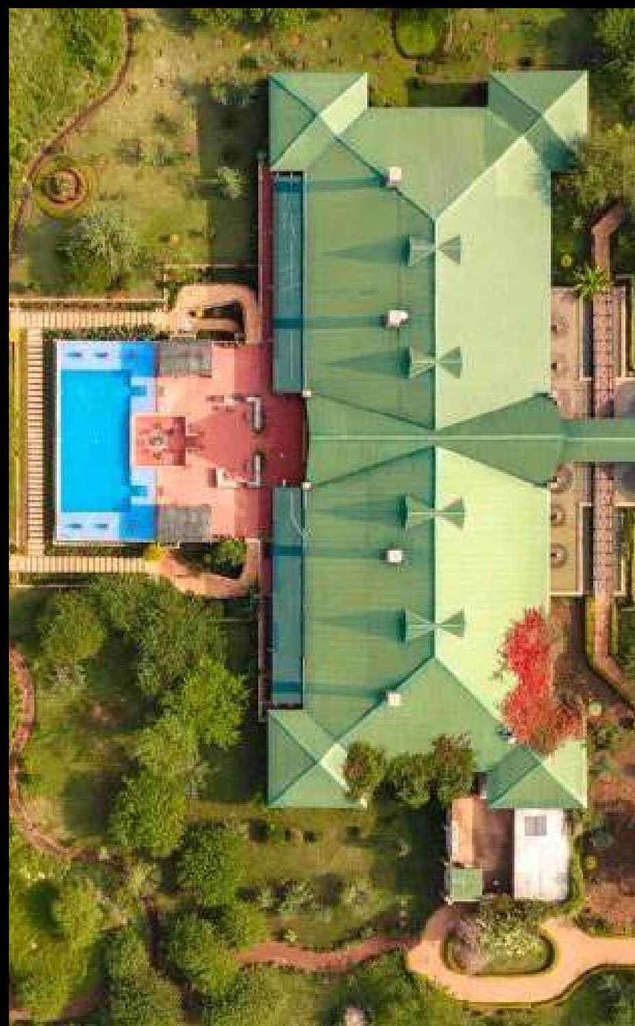
Oldeani Mountain Lodge