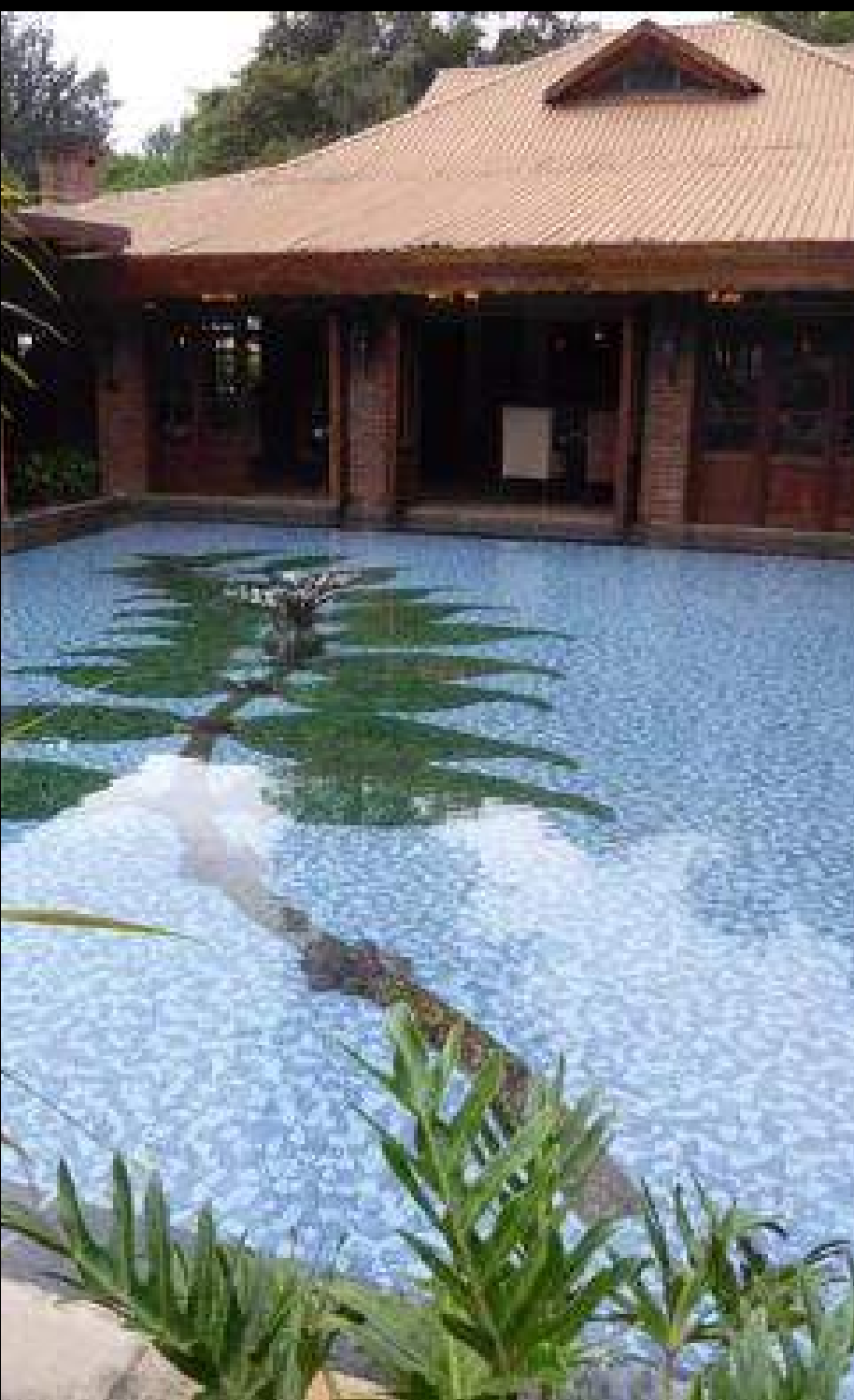
Arusha Coffee Lodge,