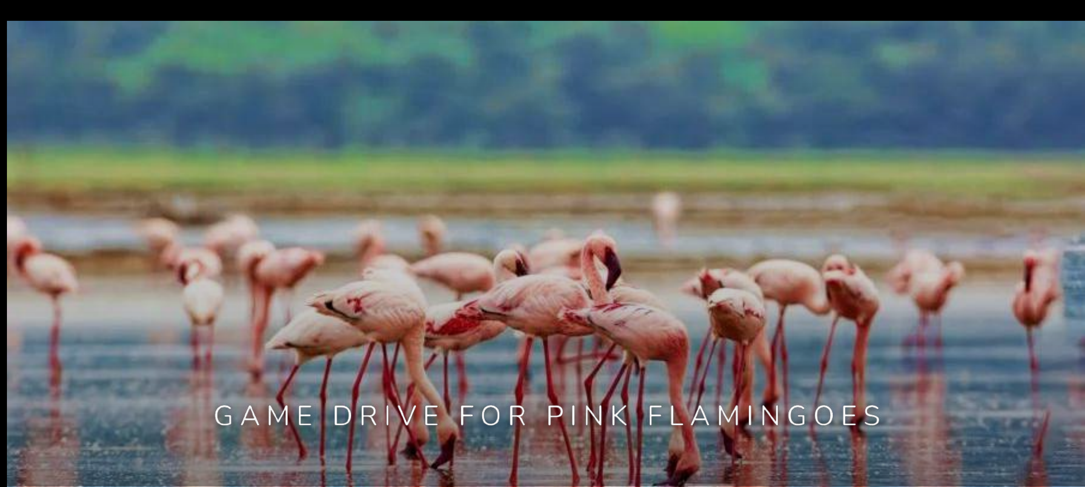
GAME DRIVE FOR PINK FLAMINGOES