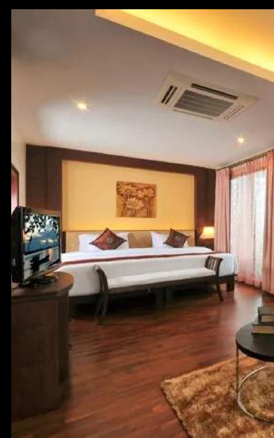
Salana Boutique Hotel