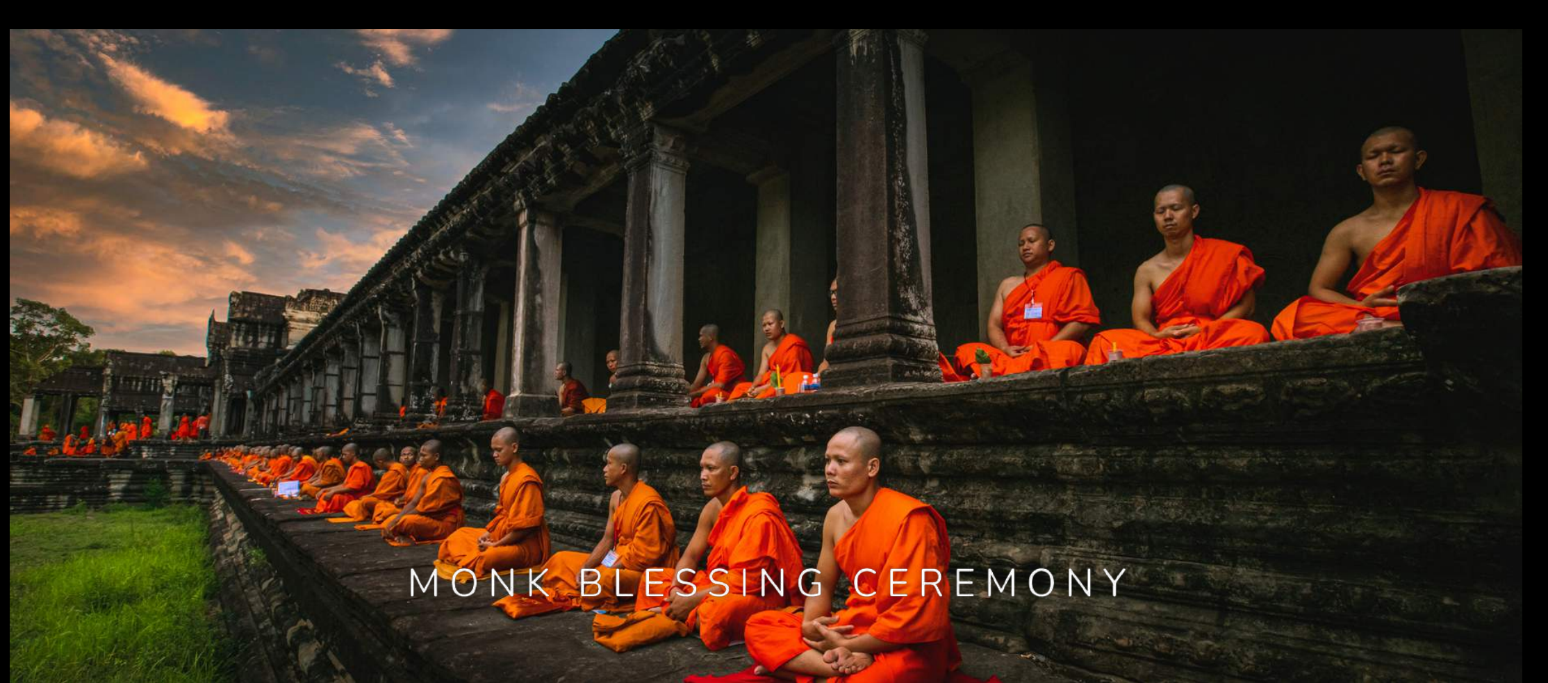
MONK BLESSING CEREMONY