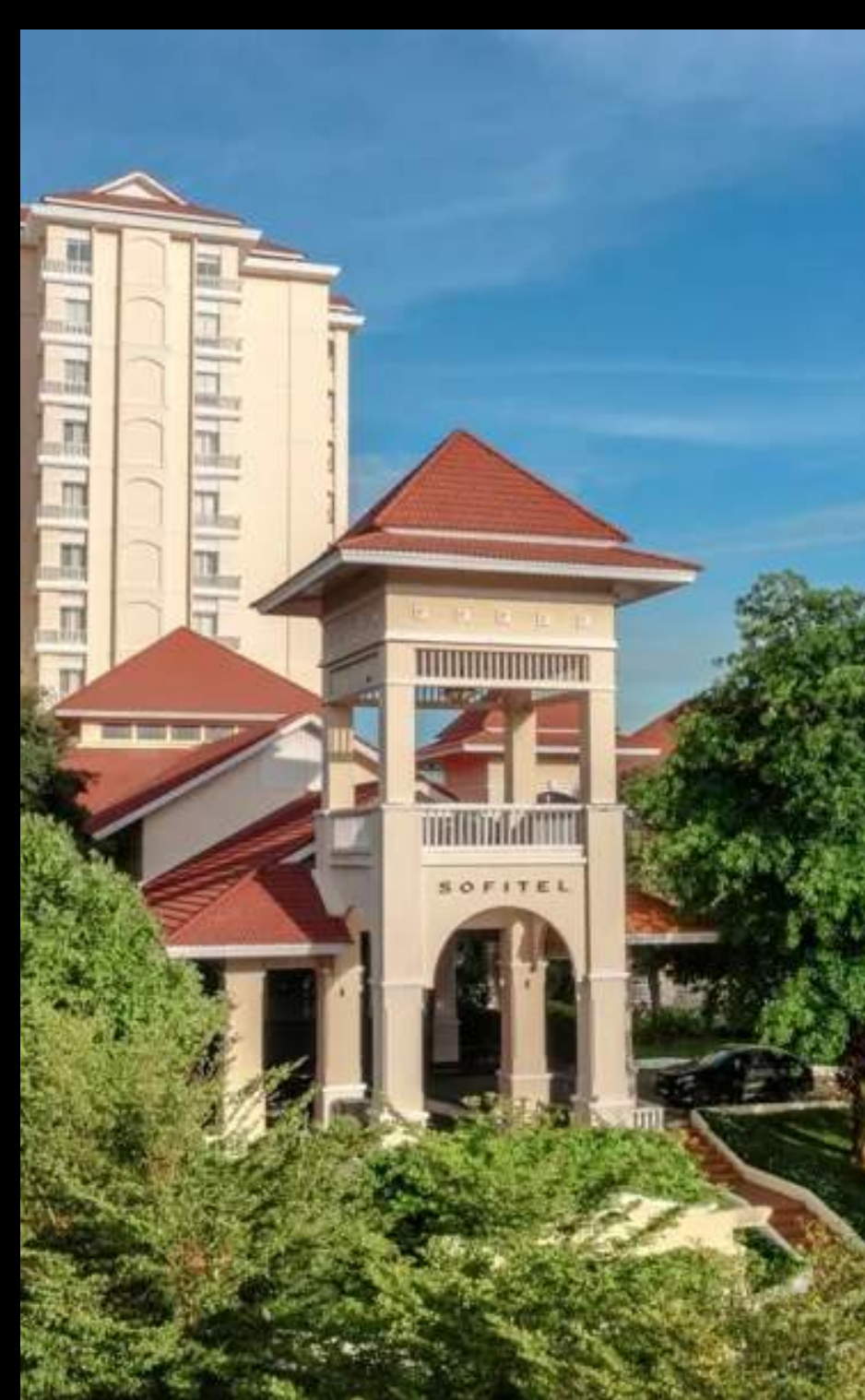
Sofitel Phnom Penh Phokeethra