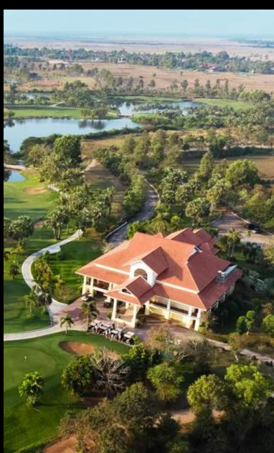
Sofitel Angkor Phokeethra Golf and Spa Resort