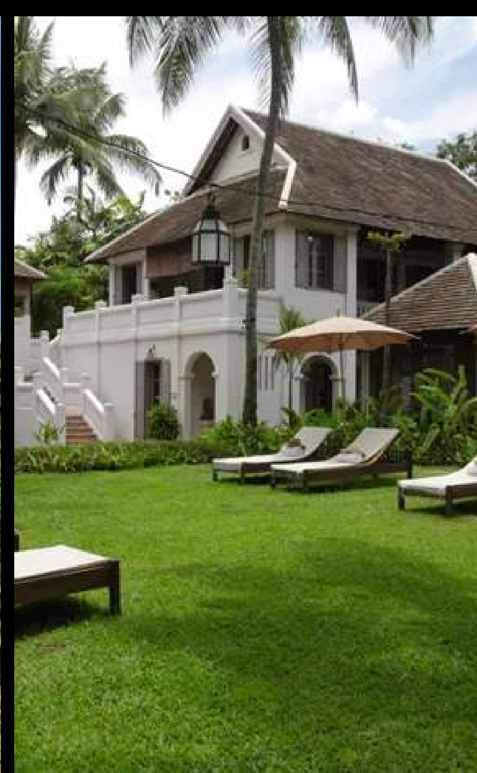
Satri House Hotel