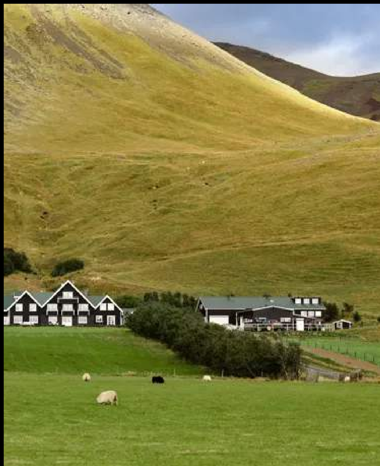
Skálakot Manor Hotel