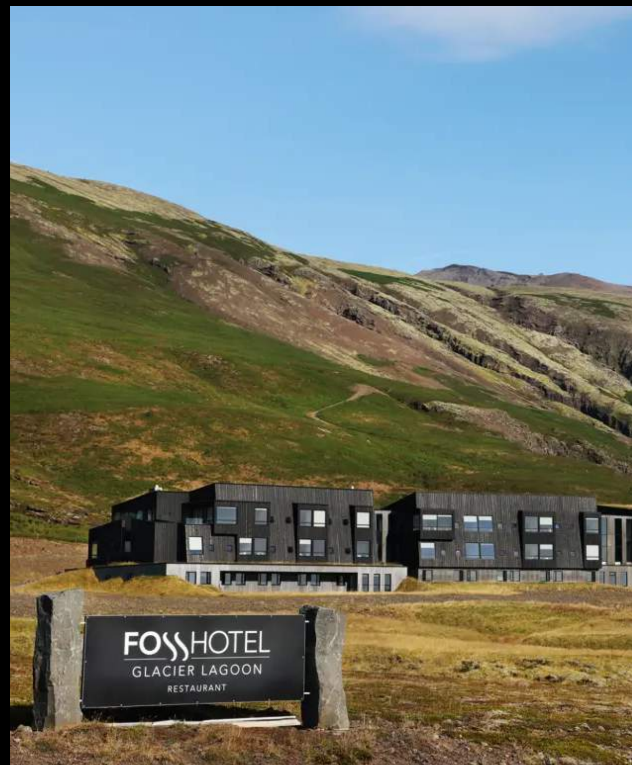
Fosshotel Glacier Lagoon